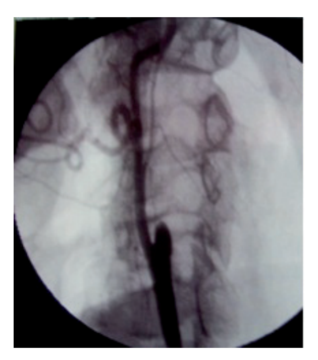
Figure 3. Pencil type ending occlusion of the left ICA was demonstrated just behind bifurcation on bilateral carotid angiography.

We postulate that thrombosis might have been developed due to intimae injury. Elongation of atherosclerotic plaque in both proximity of thrombosis level might be considered as an evidence of plaque rupture. In unilaterally carotid occlusions conservative treatment methods are applied as in our patient.<sup>6</sup> As carotid occlusion may develop four days later in near hanging.<sup>5</sup> we suggest that patients with